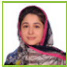
Shandana Gulzar Khan

Ranked as One of "The Top 60 Motivational Speakers In The World"